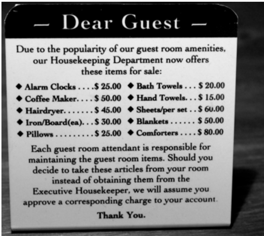
Figure 3.1 - “Dear Guest” Price-List Sign