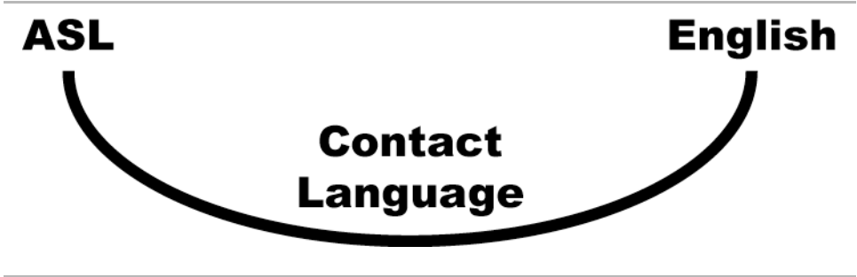
Figure 4.1 - Traditional ASL-English Continuum

“May You Live in Interesting Times.” - Ancient Chinese Curse